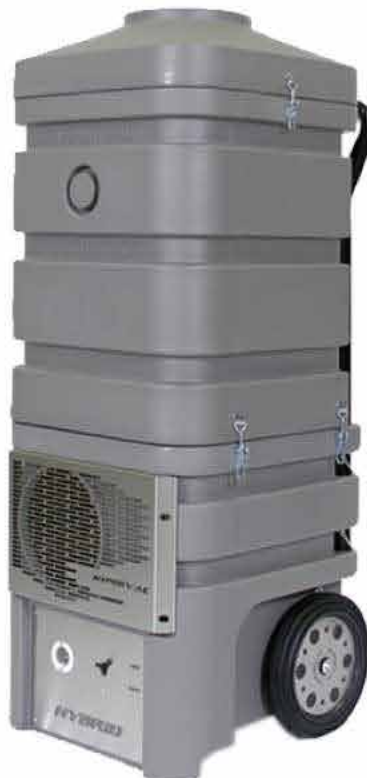
120 Volt Hybrid