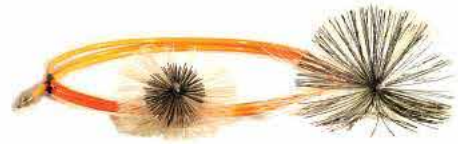
Scandtech Brush System