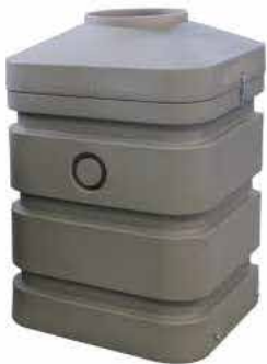
Extra Filter Tub