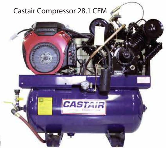
Castair Compressor 28.1 CFM