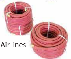
200 ft Air lines