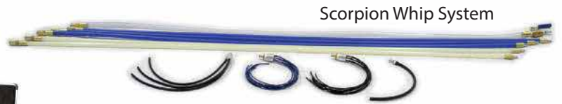
Scorpion Whip System

220 Volt Variable Speed Revolution HYBRID Vacuum with Extra Filter Tub Castair Compressor 30.3 CFM I13GH3HC2 Honda GX390 30 gal, Rope/Elec. start 25 feet of 8" or 10" vac hose with connecting collars Reverse skip line tool Blue heavy duty Forward skip line tool Nylon Scorpion Whip System Scandtech Brush System Full Cobraview Camera System 200 feet air lines with couplers Duct Hose connecting flange 2- 50 foot Electrical cord Quick 220 Splitter Box Hose connector flange