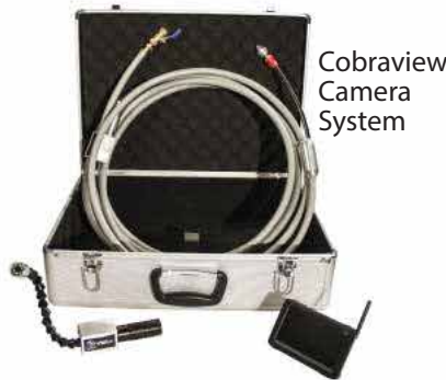
Cobraview Camera System