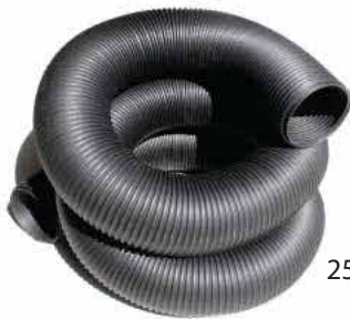
25 feet of vac hose