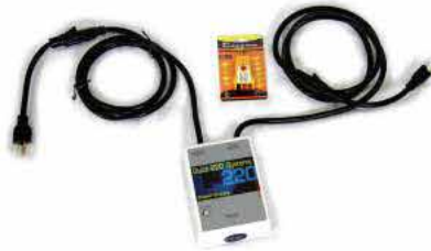
Quick 220 Splitter Box