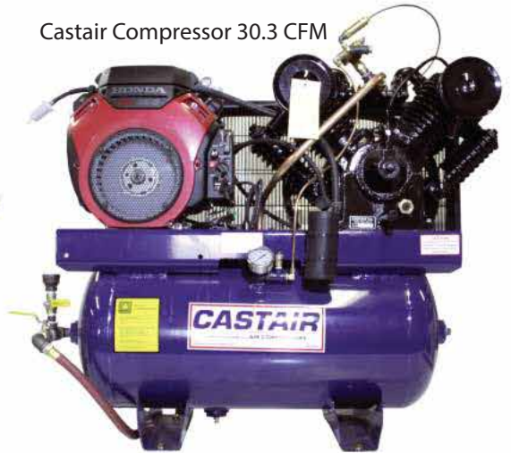
Castair Compressor 30.3 CFM