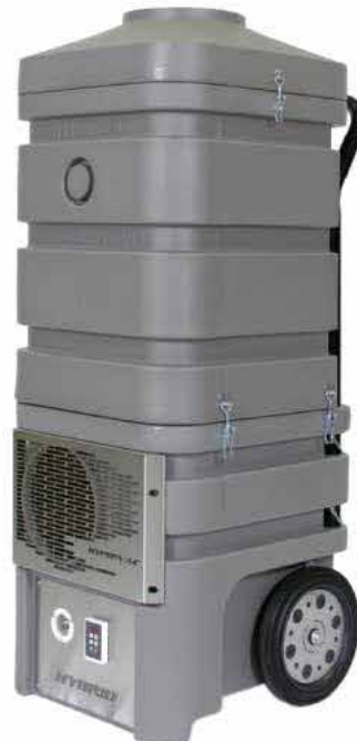
220 Volt Variable Speed Hybrid